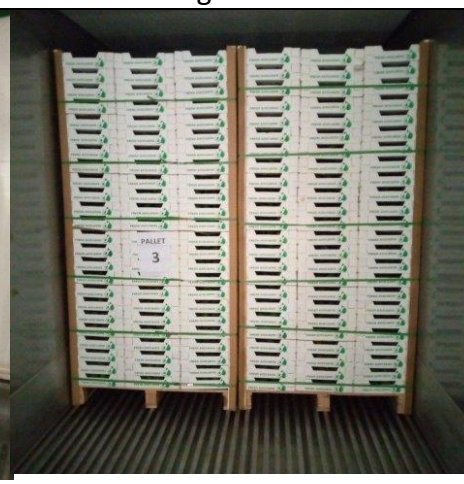
Loading into container