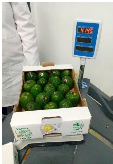
Weight control – 22 size