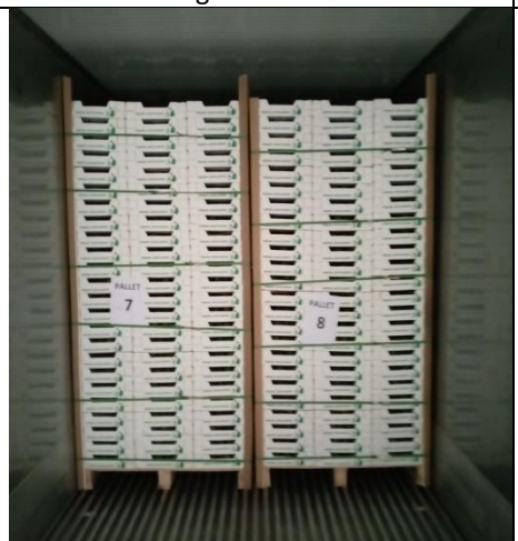
Loading into container