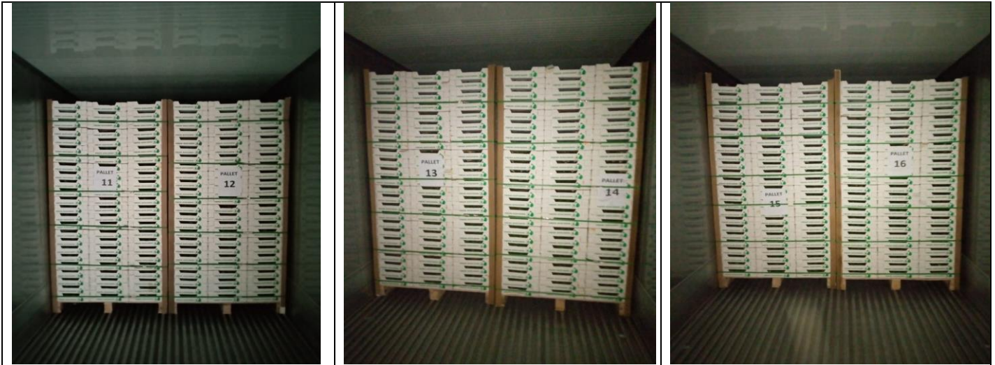
Loading into container