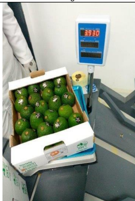
Weight control – 24 size