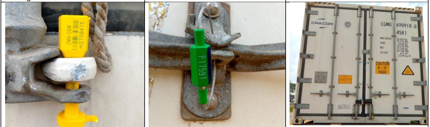
Shipping line seal