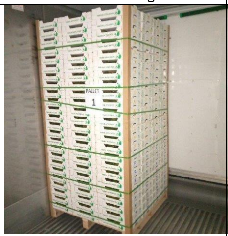
Loading into container