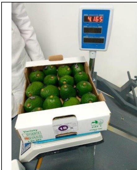
Weight control – 18 size