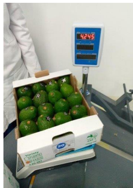
Weight control – 20 size